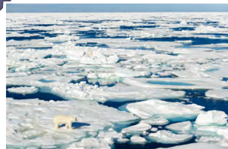
Polar bear on the Arctic sea ice