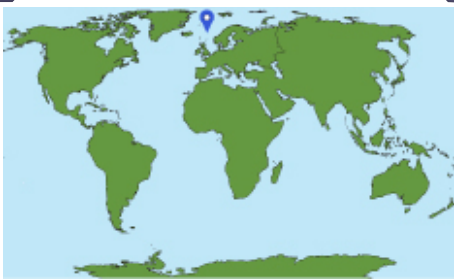
The Arctic Ocean