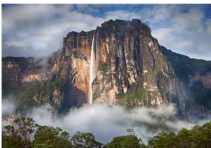
Angel Falls, Venezuela